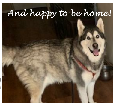
And happy to be home!