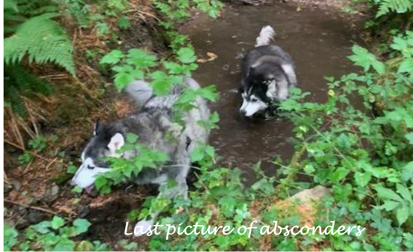
Last picture of absconders

I recommend never allowing your pup off leash or fit them with a GPS tracking collar.