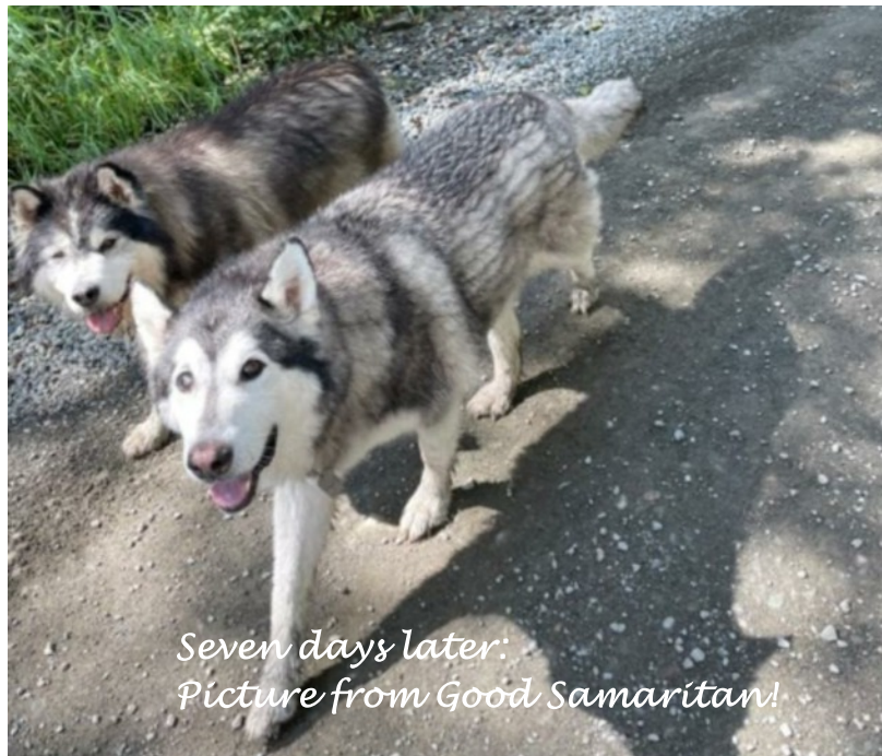
Seven days later: Picture from Good Samaritan!