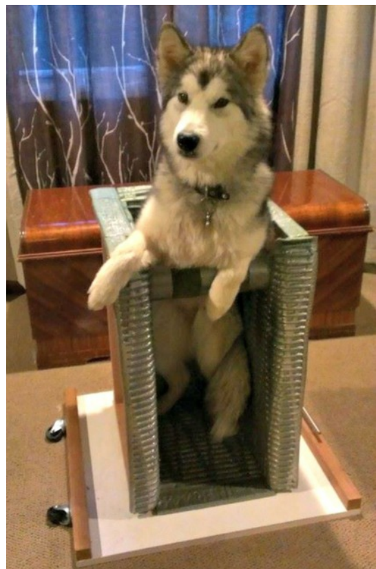
Bettie (pictured above) and Sura (pictured below) prepare for dinner. Born with ME, they are thriving in Nebraska.

There are great resources available. If you know someone who is dealing with this disorder, please direct them to http://www.caninemegaesophagus.org/