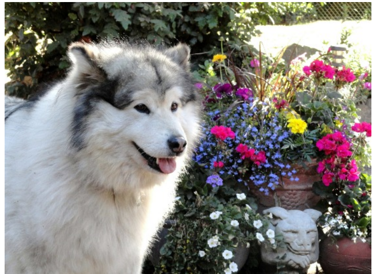
Sylvia's DeeJay Fuzzbutt MCGuillicutty showing Respect for a cluster of plants