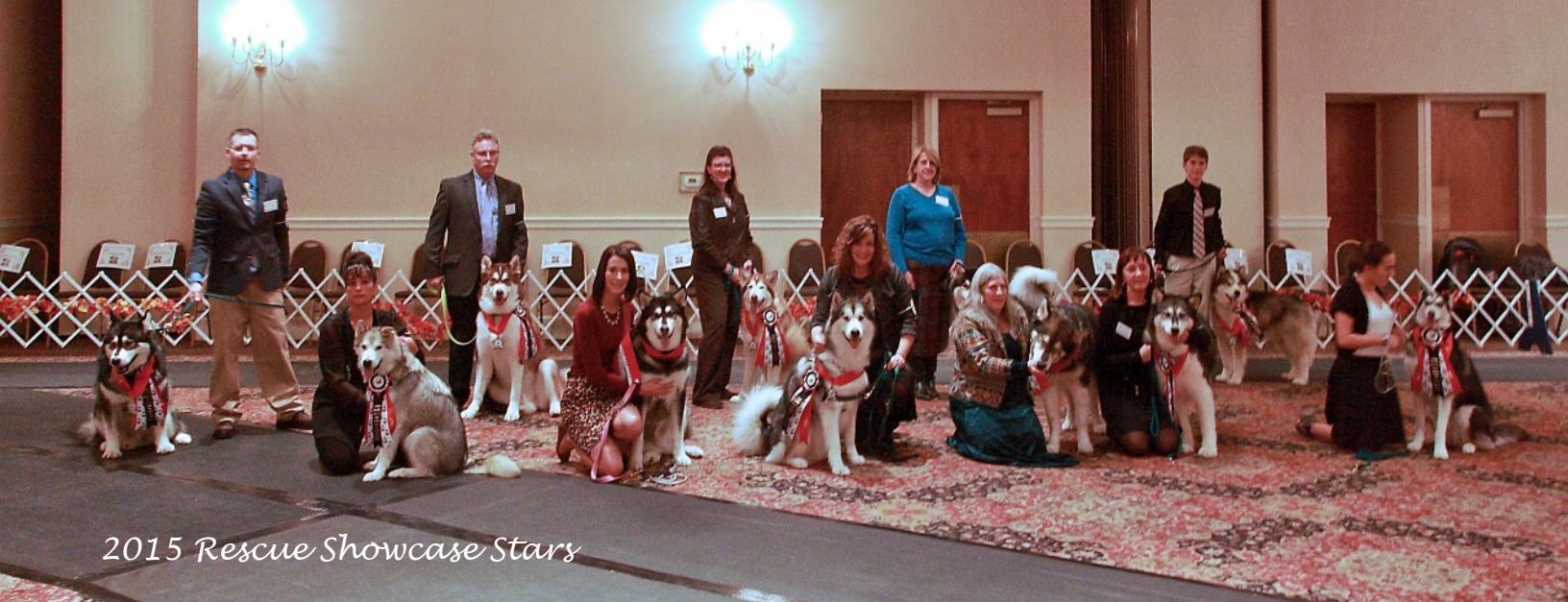
2015 Rescue Showcase Stars